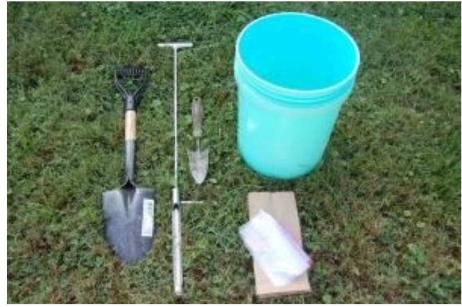
Grab a shovel/garden trowel or a soil probe (available for loan at many county Cooperative Extension Service offices), a clean dry bucket, a sharpie, and clean, spillproof bags.