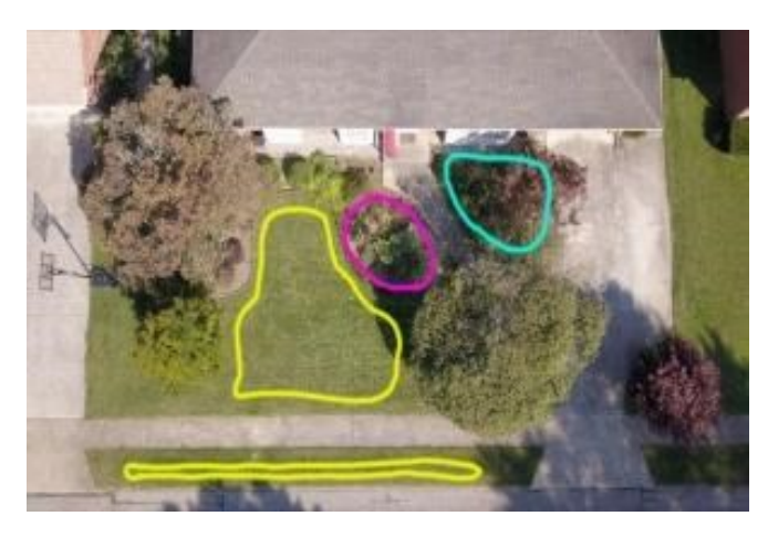
Step 2 - Identify Sampling Locations

Identify areas of your lawn, vegetable garden, or flower beds with plants requiring specific soil conditions such as blueberries, azaleas, and rhododendrons. Look for different environments in your yard and collect separate samples from areas that are mostly sunny versus those in deep shade, or dry areas versus wet areas.