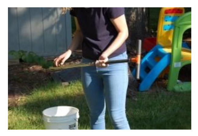
Step 3 - Collect Samples

Work by area (e.g., lawn, vegetable garden, flower bed, etc.) and collect samples from 6 -8 random locations within that area, keeping the soil from each area separate (i.e. in one bucket). Collect about 2 cups of soil for each area (e.g., lawn, vegetable garden, flower