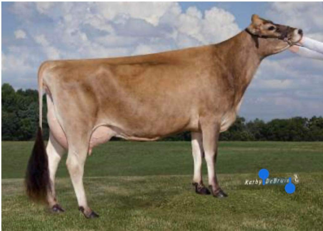
Cow: Ahlem Viabull Vanity 5057-P