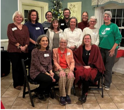
The 2024 Master Gardener Graduates.

2893 Number of people who gained knowledge in consumer and home horticulture including: native plants, disease and pests, composting, site analysis, and proper maintenance.