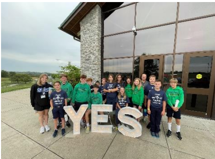
A sixth grade class attending Find Your Yes Day at the KSU Research Farm.

153 The number of youth who gained/ strengthened the ability to express their thoughts and opinions.