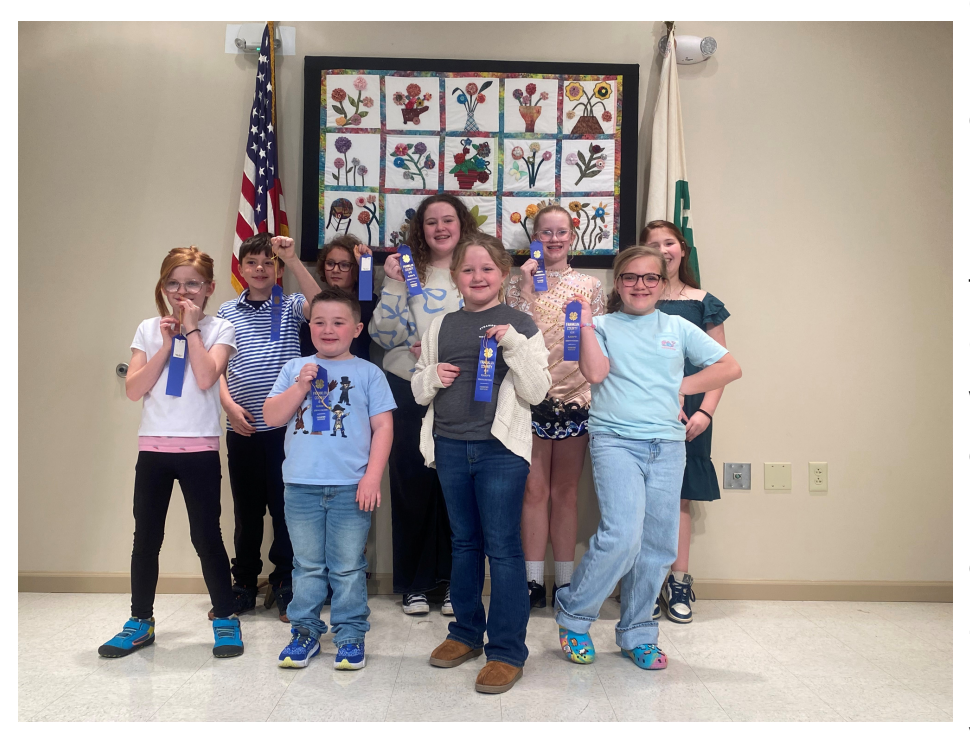
4-H'ers showing off their ribbons!

On March 17th, we had 9 participants in the county demonstration contest. Youth had demonstrations ranging from Millennial upcycling, how to tie a fishing hook, many yummy cooking demonstrations & a wonderful performing arts demonstration. Next youth will be participating in the area demonstration contest on April 29th here in Frankfort. GOOD LUCK to the Franklin County youth who will be competing!