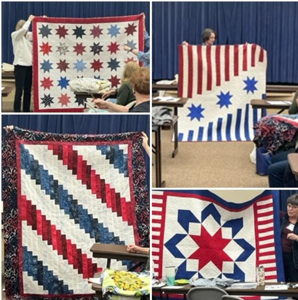
Quilts of Valor