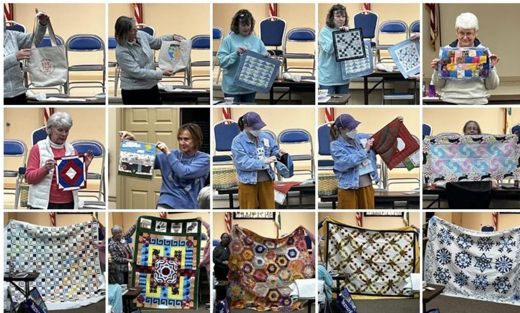
Show & Tell, March 25, 2025