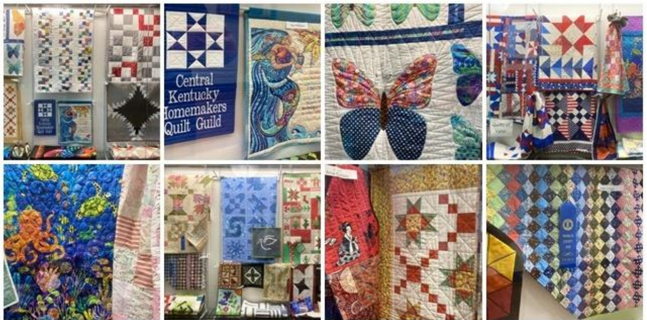
Photos from the annual Library display.

If you are not selling, be sure to come by and shop!!!