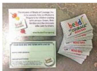
Beads of Courage Bag Kit contents