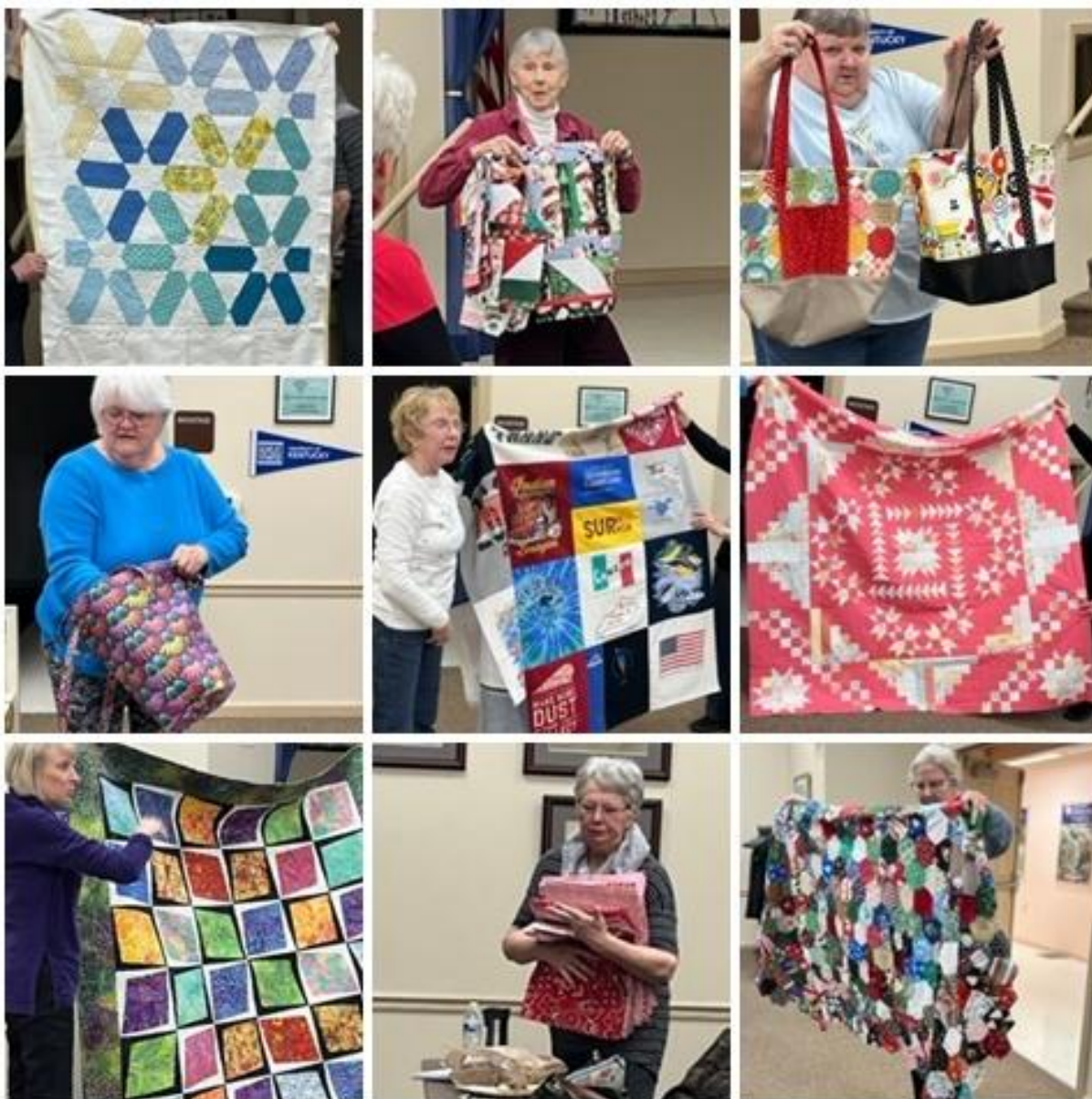
SHOW & TELL-JANUARY 24. 2023