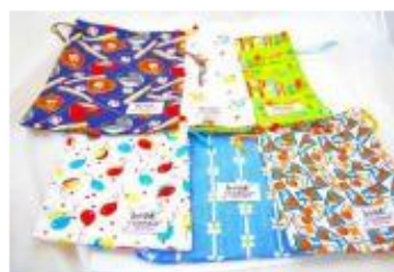
Example of completed bead bags

*A heartfelt thank you to Nancy Fay for providing these detailed bead bag instructions.