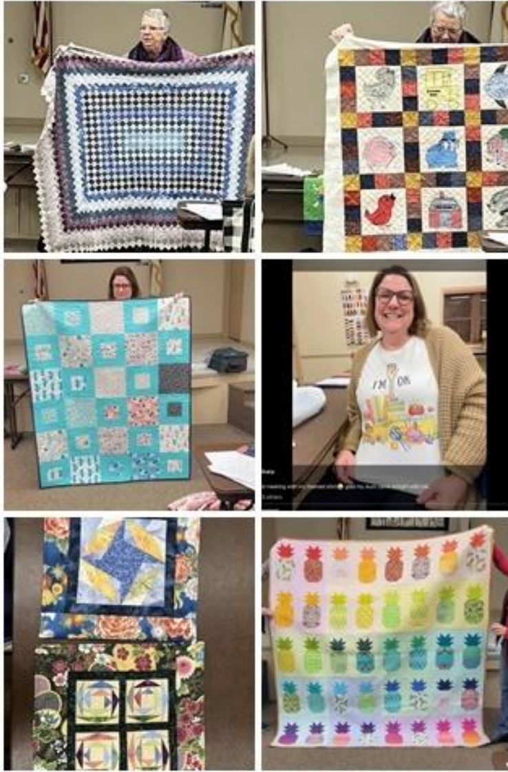
Show and Tell, January 23, 2024