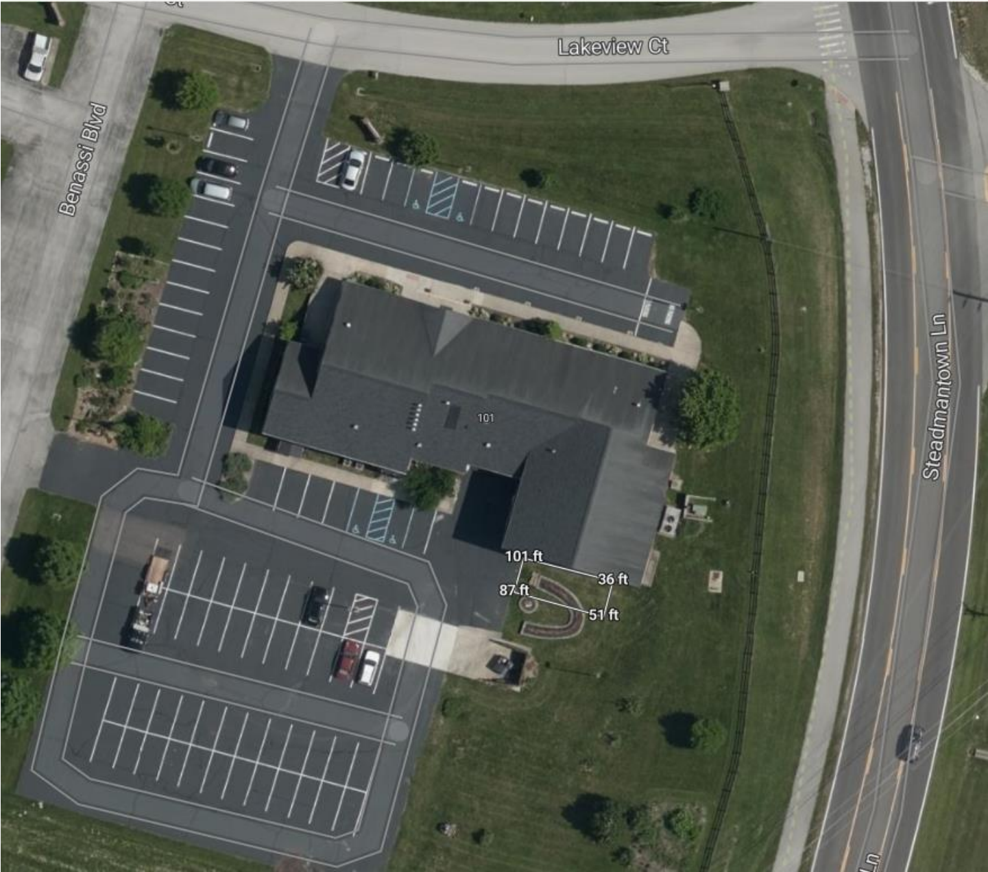
Attachment 1: Greenhouse location