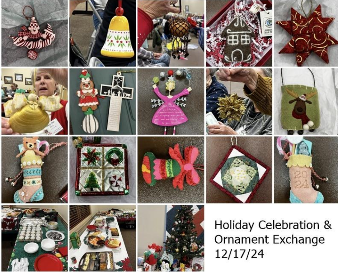
Holiday Celebration & Ornament Exchange 12/17/24