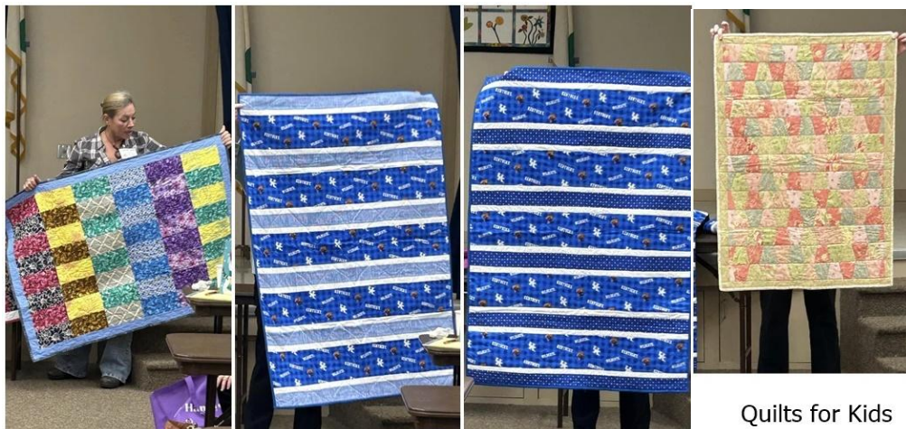
Quilts for Kids