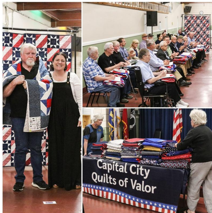
May 19, 2025 award ceremony