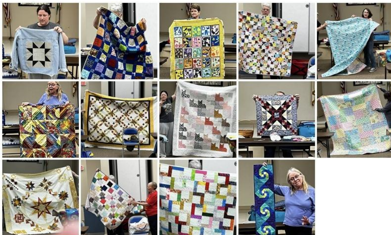
Show & Tell, April 22, 2025