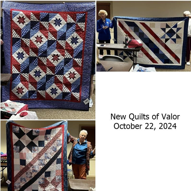
New Quilts of Valor October 22, 2024