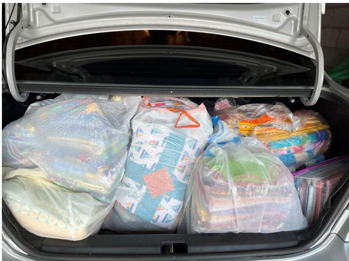
Debbie Poole's trunk is FULL of Quilts for Kids donations!