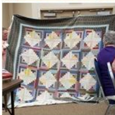
Quilts from Vickie Coleman's collection